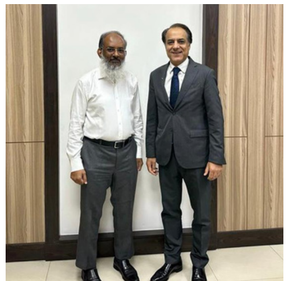
Bangladesh NDB Board of Director

Discussions have started with CAF for a joint project evaluation in Brazil in 2024. IEO will take part in the 2023 Asian Evaluation Week that will be held in Bangkok, from 11-14 September. It is also sponsoring the Asia Pacific Evaluation Association (APEA) Conference from 4-7 December 2023 in Manila, Philippines. Moreover, IEO is working with ECOI to organize the EvalFest, which will take place in New Delhi from 21-23 February 2024.