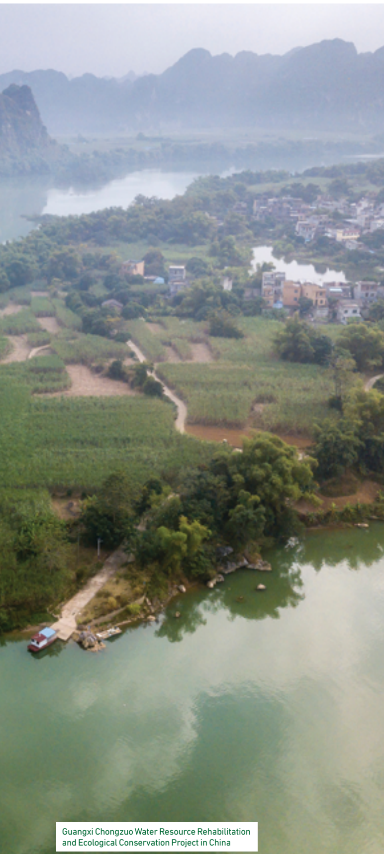
Guangxi Chongzuo Water Resource Rehabilitation and Ecological Conservation Project in China